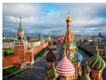
The Red Square